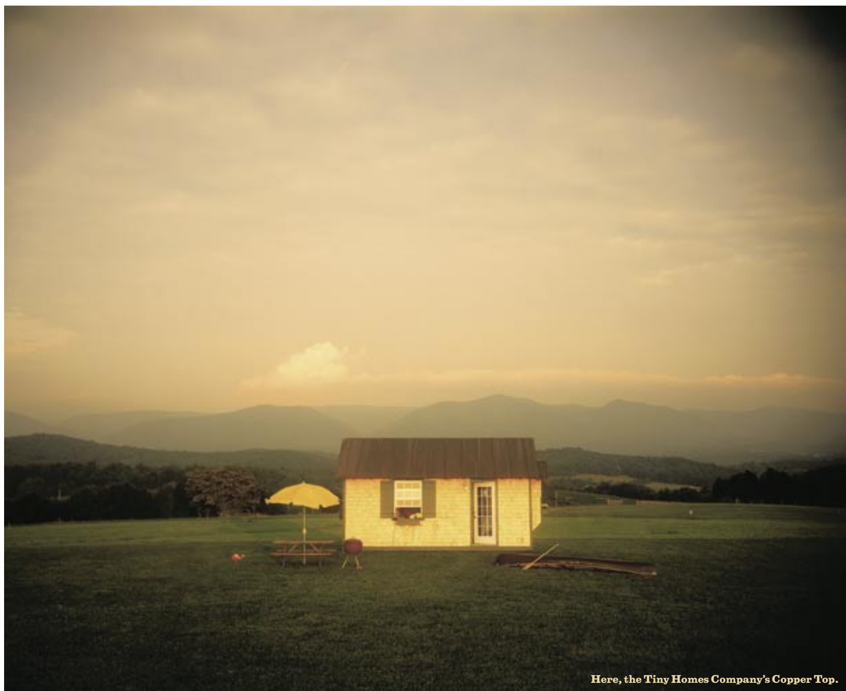
Here, the Tiny Homes Company's Copper Top.