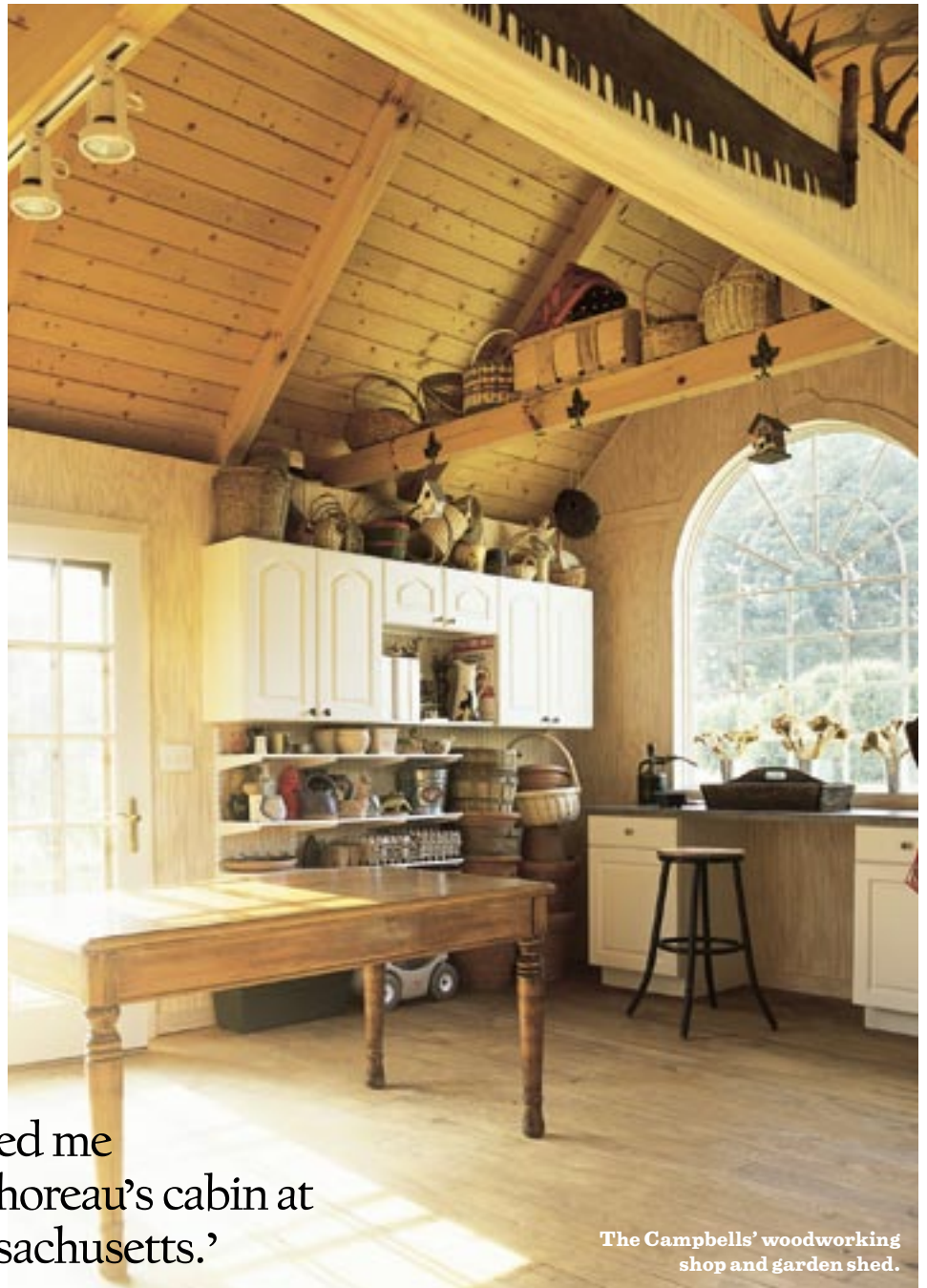
The Campbells' woodworking shop and garden shed.